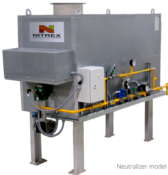
Neutralizer model IN-150

Highly recommended for gas nitriding / nitrocarburizing furnaces, the Nitrex line of high temperature neutralizers is designed to eliminate residual ammonia and/or other pollutant gases and minimize NO x emissions.