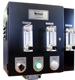
Reference Air & Burn-Off System

Accessories are also available, including probe conditioning systems, mounting flanges, and redundant probe control solutions.