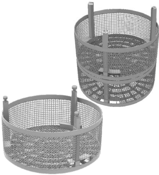
Round, stackable, wire mesh baskets available in a choice of gauge and spacing combinations.